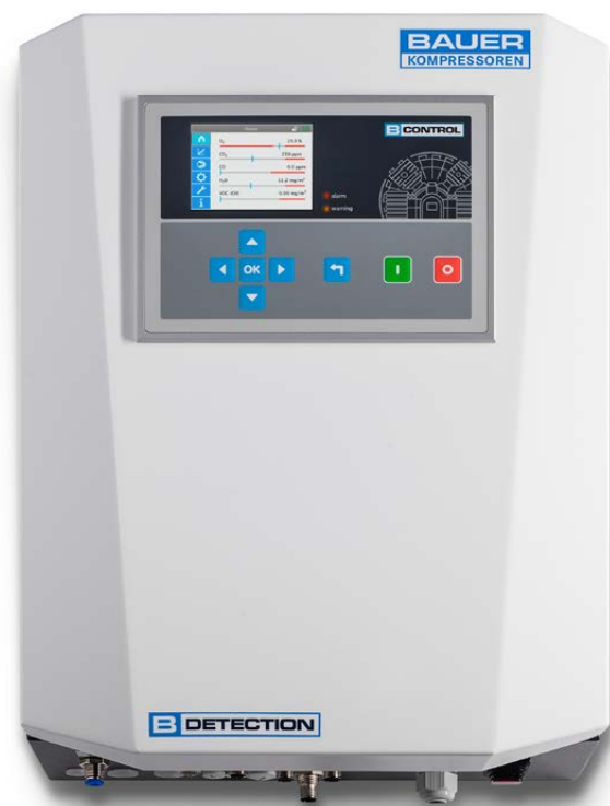
Standalone version: B-DETECTION PLUS s

B-DETECTION PLUS Gas Measurement System monitors the quality of the breathing air you produce , measuring CO, CO 2 , O 2 as standard and offering options for absolute humidity and residual oil (VOC) 1 . Automatic, continuous and ultra-reliable.