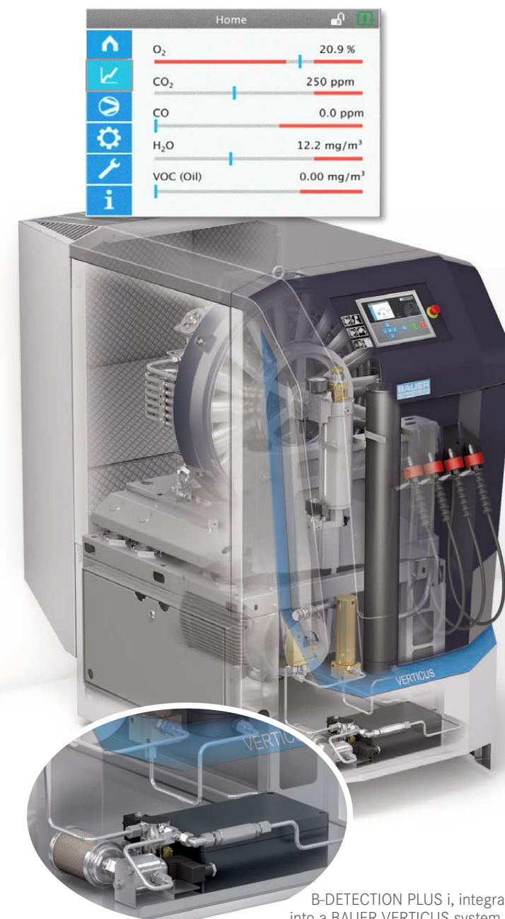
B-DETECTION PLUS i, integrated into a BAUER VERTICUS system